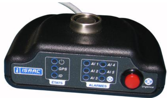
IDNHM1 - Dashboard User Interface