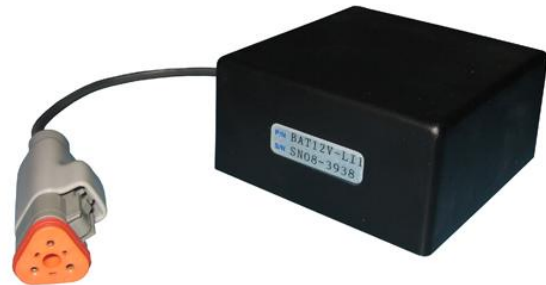
Lithium-Ion Battery Pack (BAT12V-LI1)